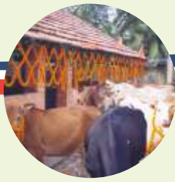
Tiny Village With Goshala