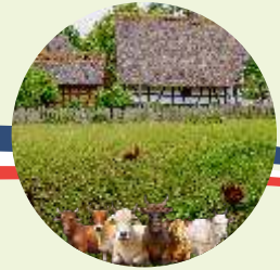
Rural Retreat Region