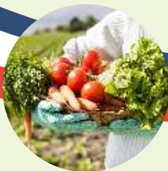
Fascinating Organic Farm

This is an excellent opportunity to live close to the IT hub, away from the hustle and bustle! The Hill City project has excellent Road and Rail access. It is adjacent to the projected elevated Growth corridor, TMV, RRR, MNC's, IT SEZ's, Educational Institutions, renowned Multi-speciality Hospitals, Government Offices, and popular Tourist Destinations.