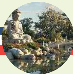
Panoramic Studio Park