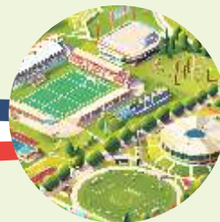
Spectacular Sports Complex