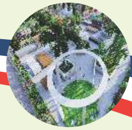
Work from Park Amidst Nature