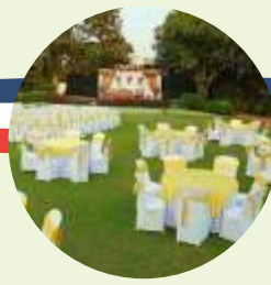
Destination Party Venue